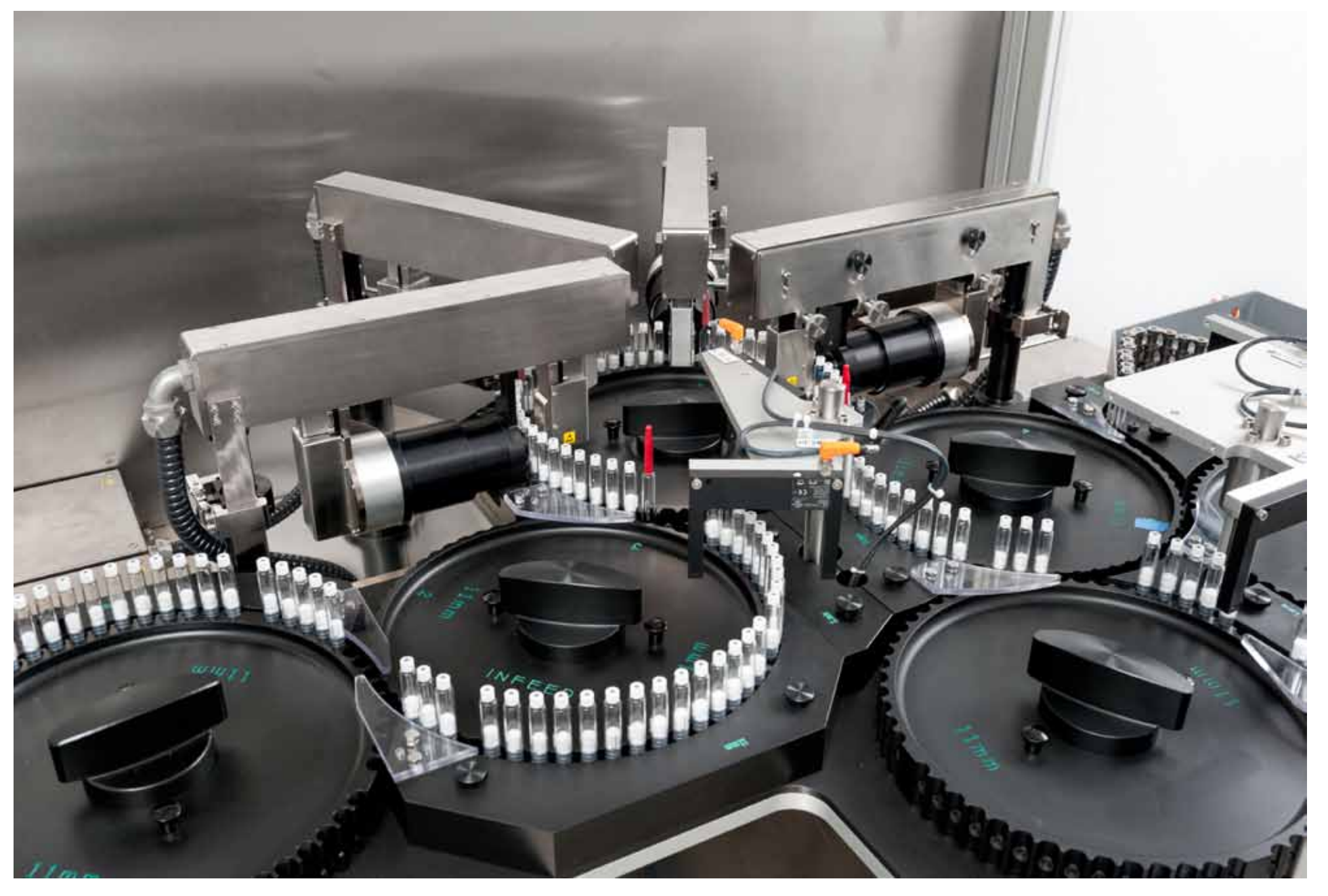
Photo 1 A close-up of the four oxygen sensor heads configured on a headspace inspection machine to inspect dual chamber freeze dried cartridges.

A Headspace Oxygen Inspection Machine was configured for the inspection of the dual chamber freeze-dried cartridges (see Photo 1). The machine was configured with four FMS laser sensors to measure the headspace oxygen levels in the cartridges. A user-defined reject limit was configured that identifies cartridges that have lost container closure integrity. These cartridges are then automatically rejected from the line.